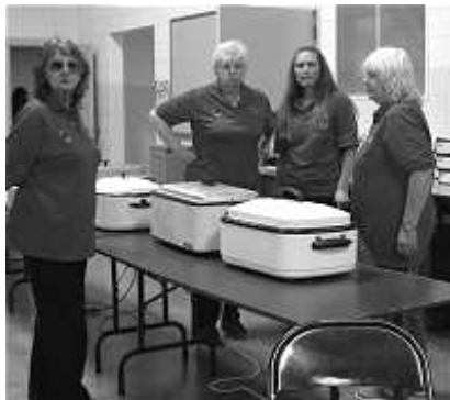
Lodge members prepare to serve National Guard members a meal donated by the Elks on December 4th at the Armory.