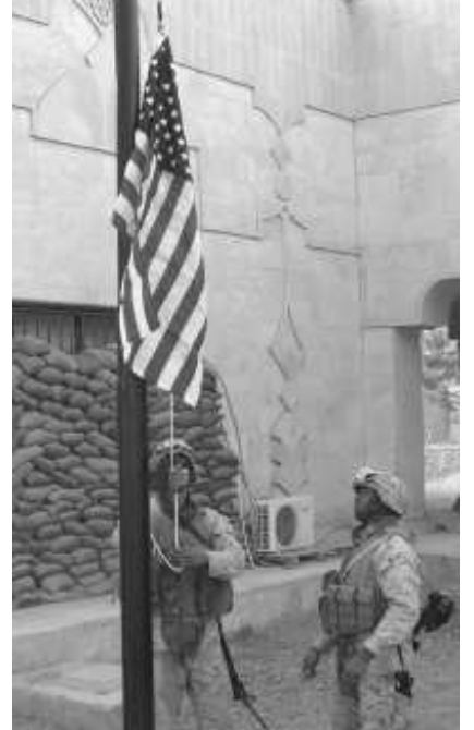
Flag donated by Deming Elks is raised on a flagpole also sent from the Elks at their base in Ramadi, Iraq. After a front page story in the Deming Headlight , an additional $100 was donated by a non-member to support the troops. That amount will be matched by the Lodge.

as the future of Elkdom is with the kids. This works for grandkids too. The Super Bowl party will be at my house on the 5th of February. The details will be posted in the bar at a later date as soon as they get worked out. Here's wishing everyone a very Happy New Year.