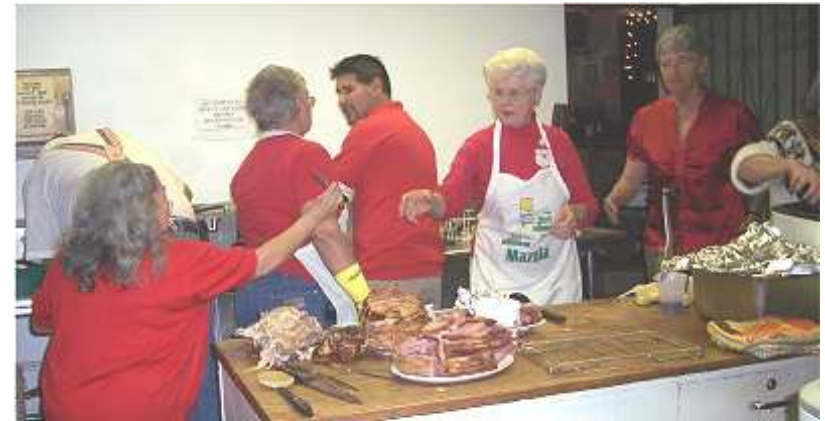
Preparing to Serve: The Lodge hosted a free Holiday meal for all veterans on Dec. 16th. Over 100 meals were served. Pictured: Workers prepare the ham, turkey, potatoes and other items.