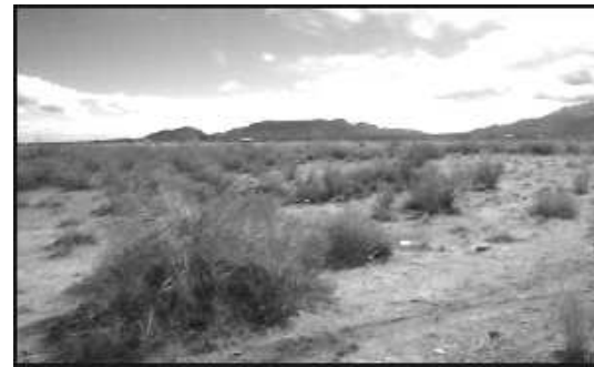
View looking east at potential site for a new Deming Elks Lodge. See the Eddie the Elk column.