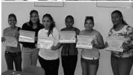
Youth Week: Top Cheerleaders. Bottom Dance Team with certificates of participation in state competition.