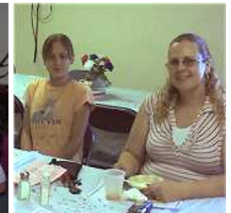
Elks Salute Youth: Left: Students enjoy one of our Youth Week hamburger feeds. About 60 students were served over three days, May 1st, 2nd and 4th. Right: Student of the Month Banquet on May 19th.