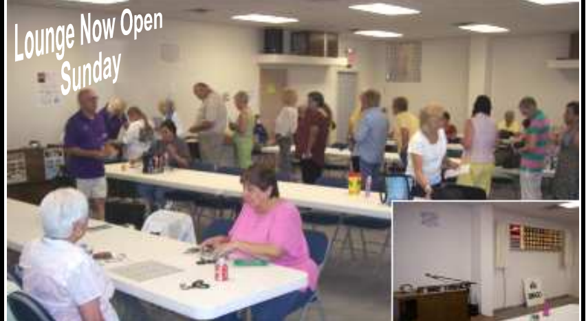
Opening Night Bingo: As of June 1st, Bingo is now held Monday nights at our new Lodge at 3401 Raymond Reed.