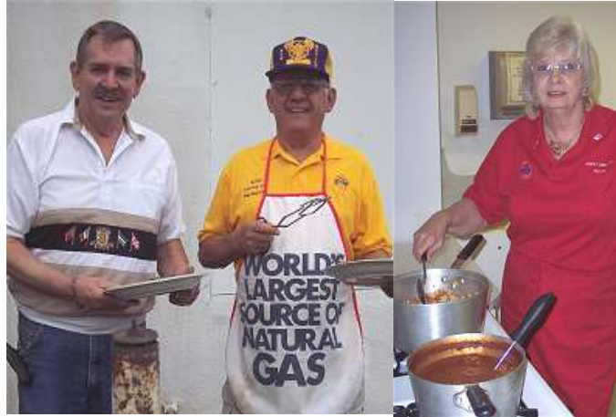
PER Dinners: The PER Association is putting on monthly steak dinners on the 4th Friday of the month (except Aug.). Next Dinner will be on September 22nd.