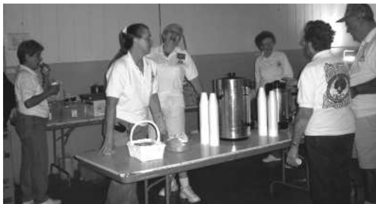
Elks Duck Race Breakfast Volunteers, Saturday Aug. 27th.

No Bingo on Monday, September 5th for Labor Day