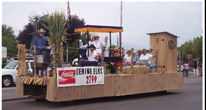
Elks: Best Overall Entry in Duck Race Parade, and winner of $300 and a plaque