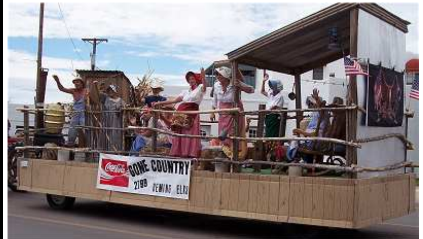
Deming Elks finish first in Duck Parade, and receive $200 and plaque

P.E.R.'S DINNER 12 ounce Rib eye steak OR half-chicken with potato, vegetable, salad, roll and dessert, $12 for steaks, $9 for chicken. Serving from 6-8 pm September 26th. Proceeds for PER Projects. Takeouts available.