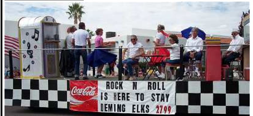
Elks Do It Again! For the third year in a row, Deming Elks took top honors in the Tournament of Ducks Parade, August 22nd, and a $200 1st Prize.

Early Bird: 6:30, Regular Bingo 7. (every regular game minimum $100), a winner-take-all game and a possible $500 progressive call game. Doors open at 6.