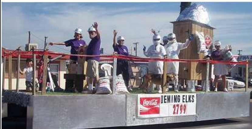
Elks do it Again! The float in the SWNM Fair Parade, with the theme Reaching for the Stars won Grand Prize! See the ribbon at the bar. Way to Go!