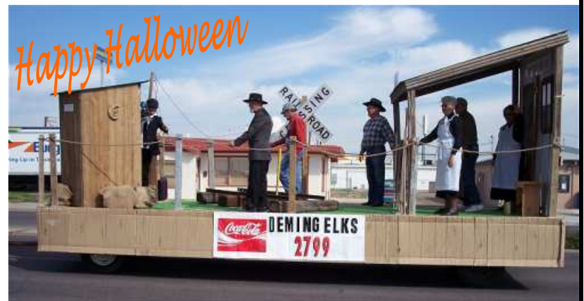
Deming Elks finish first for the 2nd straight year in SWNM State Fair Parade

P.E.R.'S DINNER 12 ounce Rib eye steak OR half-chicken with potato, vegetable, salad, roll and dessert, $12 for steaks, $9 for chicken. Serving from 6-8 pm October 24th. Proceeds for PER Projects. Takeouts available. Karaoke follows.