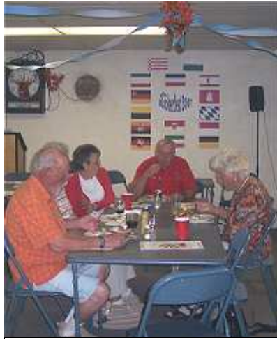
Oktoberfest was held on Oct. 13th.