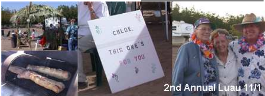
2nd Annual Luau 11/1

CP Pigs are on sale! Get yours at Pepper's Supermarket, The Hat Creek Saloon, the Adobe Deli or the Lodge. Just $1 donation. Show you care—Buy a pig!